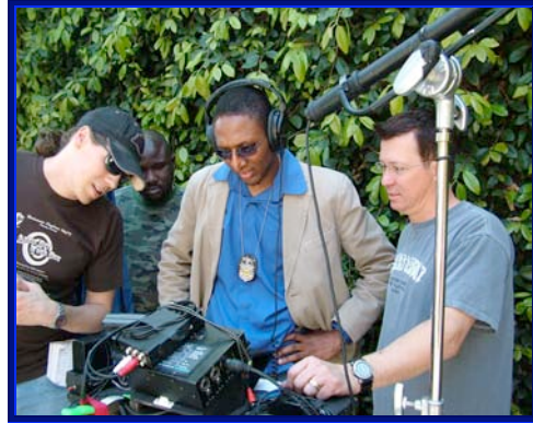
Reviewing audio and video on the set