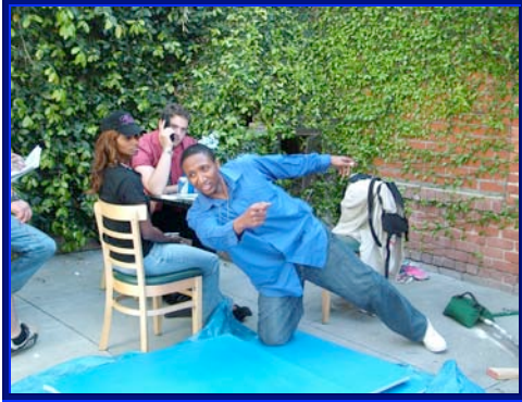
Rehearsal for dive and shoot stunt