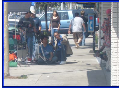
Reviewing Felon chase scene