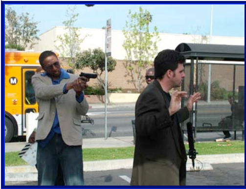
Rehearsing fire arm scene